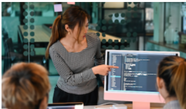
Operations & Technology